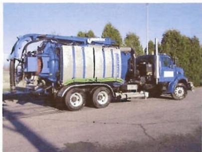
THE DISTRICTS NEW FLUSH TRUCK

The Sewer District acquired a new sewer cleaning truck in the fall of 2003. This unit replaced a similar unit that served the District needs for 17 years. The new truck's cost after a $12,000 trade-in was $171,000. This "flush truck" is the most important mobile piece of equipment at the District. It simultaneously removes debris from the sewers and pressure cleans the pipes. Foreign materials such as sand, gravel, and grease can result in blockages of sewer flow. Cleaning schedules are determined by closed circuit sewer televising inspections with the video camera purchased in 2001. Known reoccurring trouble areas are scheduled for regular internal inspections and cleaning.